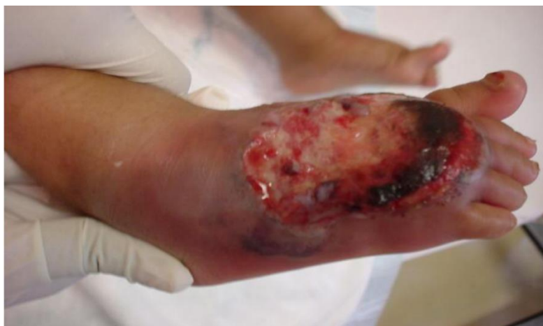
Figure 1 [6]