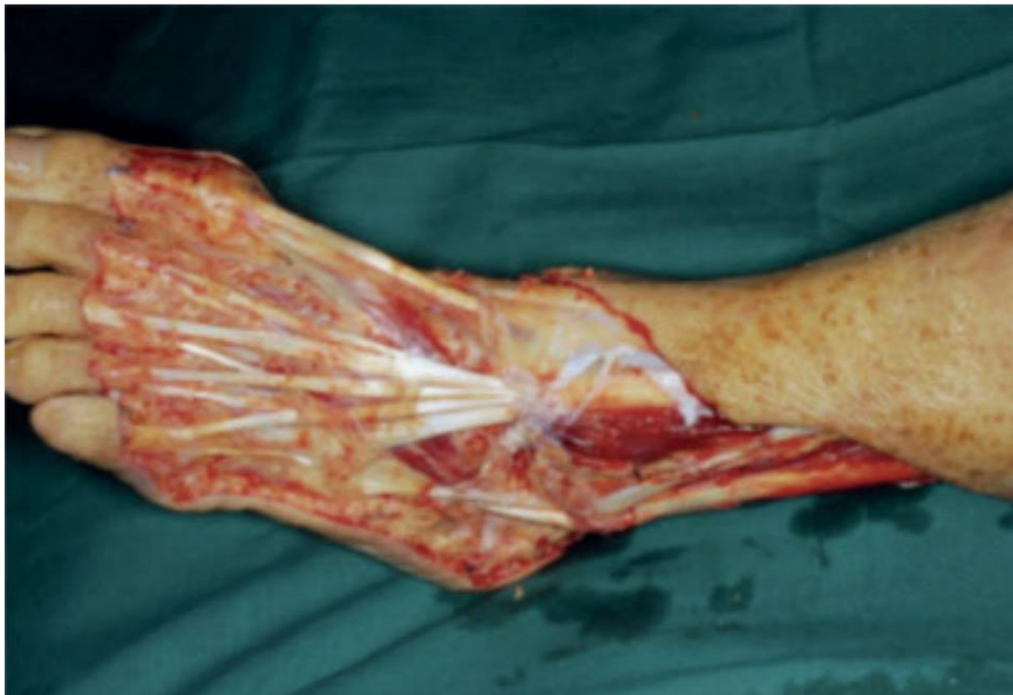
2. After debridement