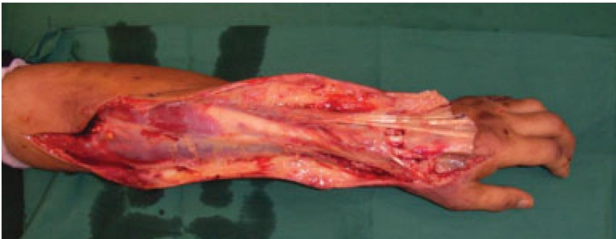
2. After debridement