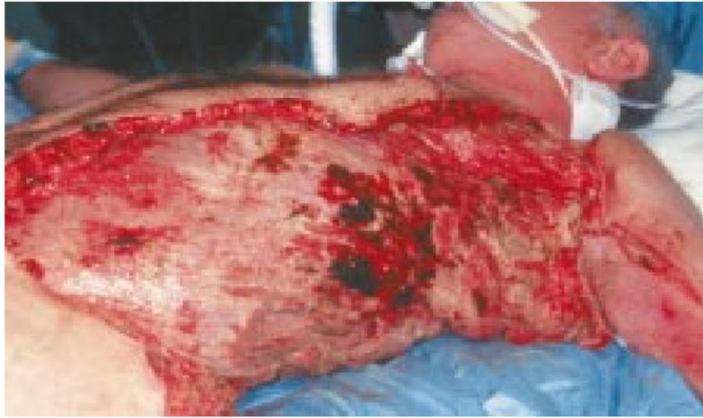
Figure 3 [8]

The patient after complete surgical debridement, with extension of the resection from the left shoulder down, including some of the pectoralis, down to the iliac crest and extending to the midline anteriorly over the abdominal cavity.