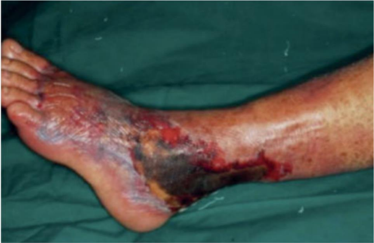
1. Necrotizing fasciitis of left foot