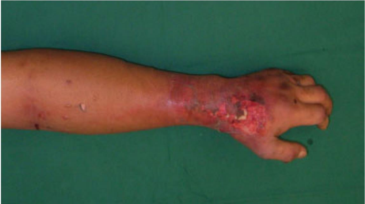
1. Necrotizing fasciitis of left arm