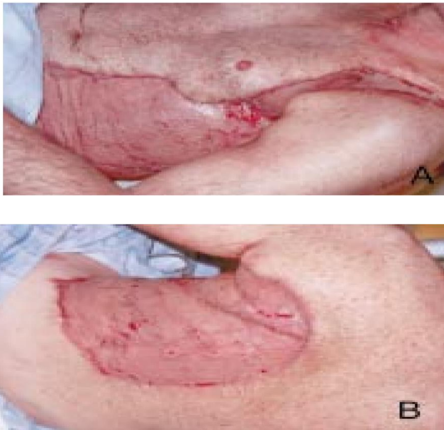
Figure 4 [9]: Anterior (A) and posterior (B) views of the split-thickness skin graft.

The patient after complete surgical debridement, with extension of the resection from the left shoulder down, including some of the pectoralis, down to the iliac crest and extending to the midline anteriorly over the abdominal cavity.