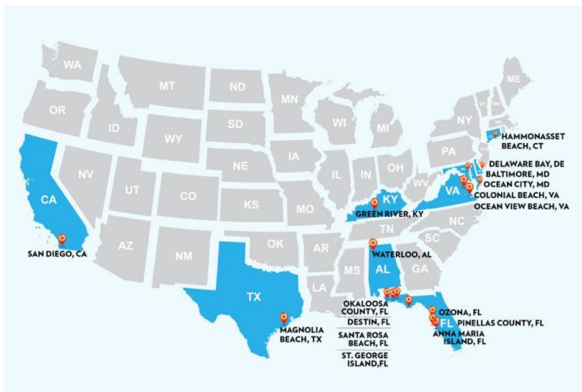
Table 6: Places in the United States Where People Have Reported Contracting Flesh-Eating Bacteria in 2019

Table 6 demonstrates that most people in the United States contracts necrotizing fasciitis (“flesh eating” bacteria) along the warm coastal waters of the states bordering the warm waters of the Gulf of Mexico. The map shows that the bacteria can also be found along the Atlantic and Pacific coasts.